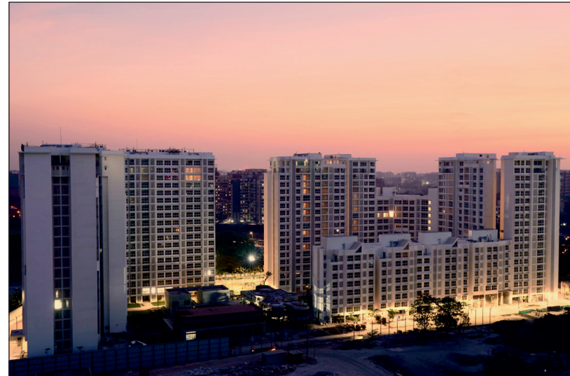
The Trees Phase - 2, Vikhroli 0.28 million sq. ft.