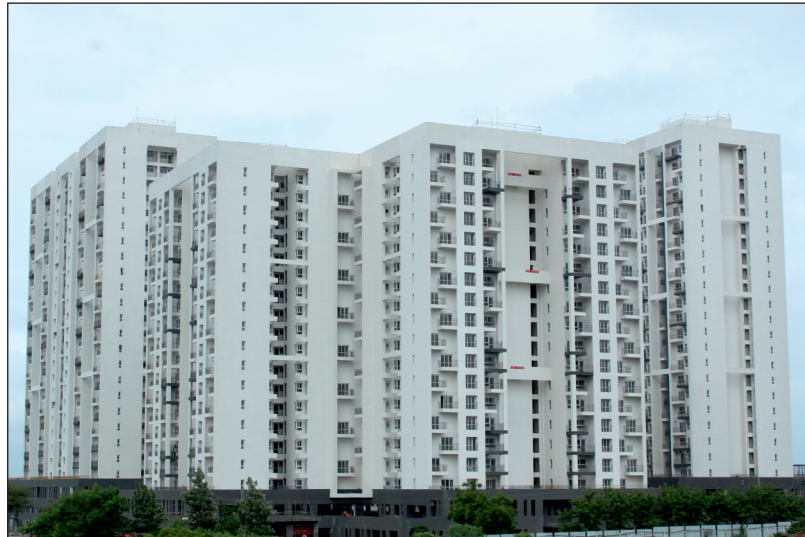
Godrej Infinity, Pune 1.1 million sq. ft.

Delivered 1.4 million sq. ft. across two cities