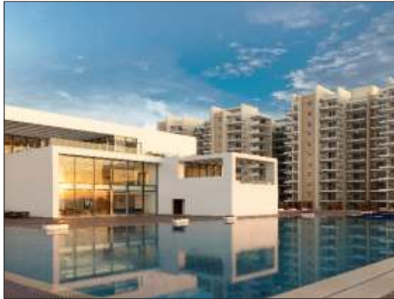
Godrej Aria, NCR 0.67 million sq. ft.