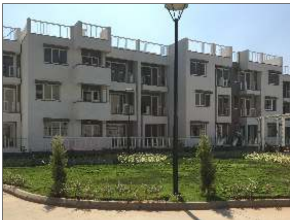
Godrej Eternity, Bangalore 0.22 million sq. ft.