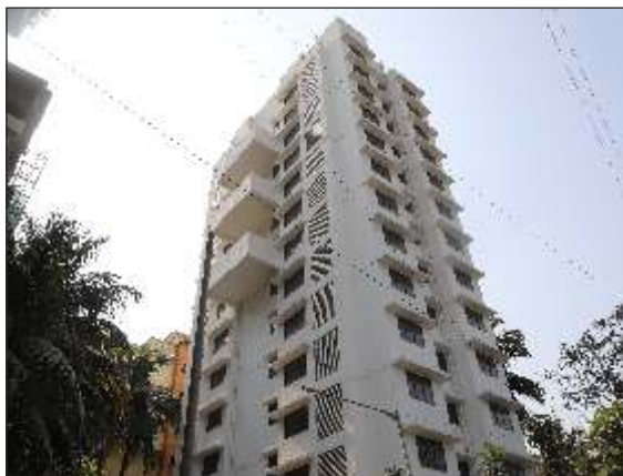
Godrej Central, Mumbai 0.09 million sq. ft.