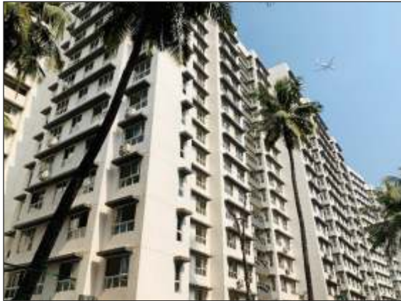
Godrej Prime, Mumbai 0.75 million sq. ft.

Delivered 1.7 million sq. ft. across two cities